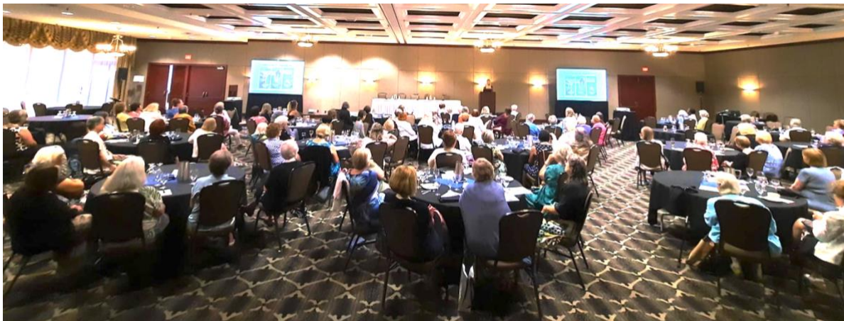
A day at the CFUW AGM.

As we head into fall, I'm excited to bring these insights and connections back to UWCM. Our shared commitment to advocacy and leadership remains strong, and I look forward to working together as we launch into a new season of programming and events. Stay tuned for what's coming next!