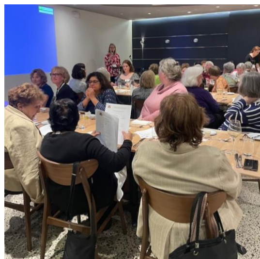
Members enjoying a monthly dinner at La Classe.