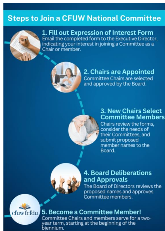
Infographic and citation from the CFUW Club Action Newsletter

Subscribe to the Club Action newsletter here .