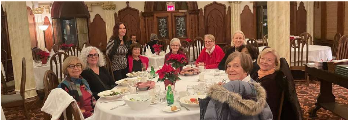
The Woman's Issues group from their meeting in November.