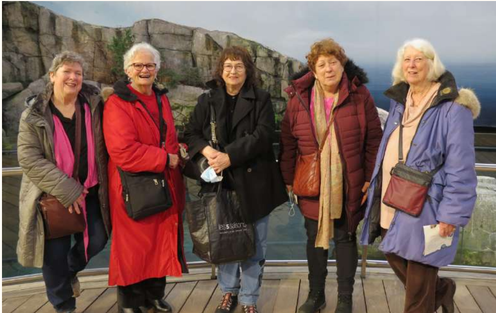
Outdoor Ladies visit the Gulf of St. Lawrence