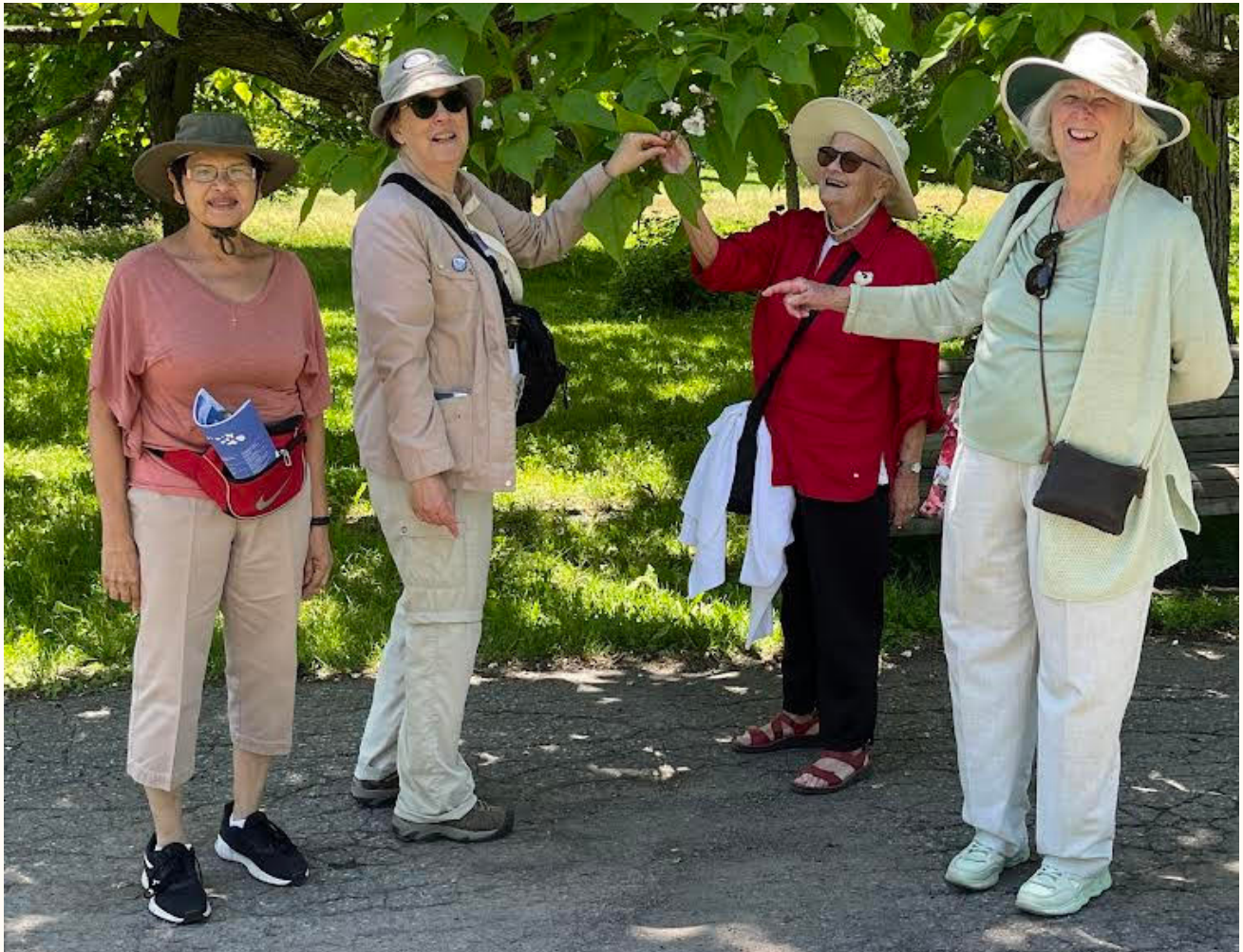
Our wonderful UWCM ladies out in the "wild" of the botanical gardens.

I love including photos of our members and their activities. Please send more to Emma at majoremma101@gmail.com to be added to the Newsletter.